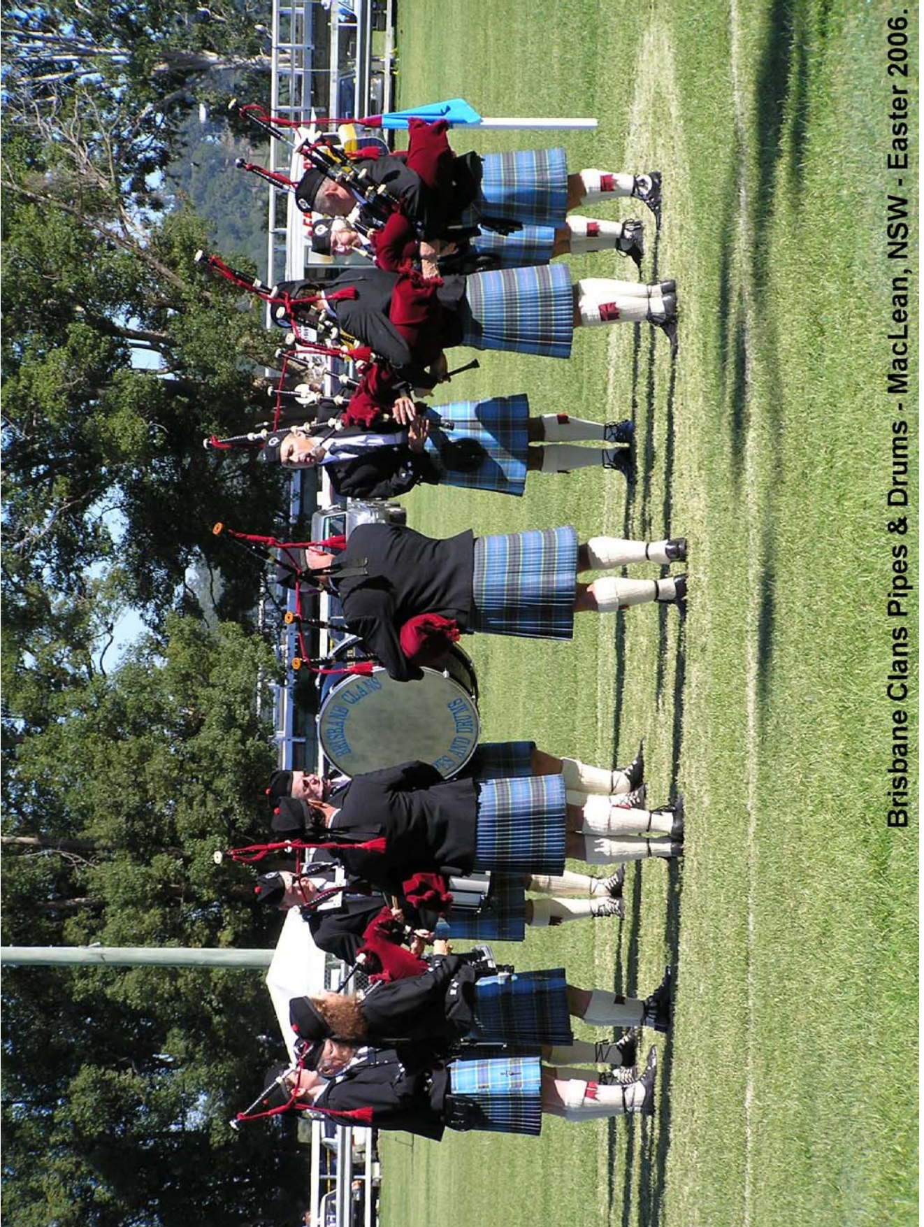
Brisbane Clans Pipes & Drums - MacLean, NSW - Easter 2006.

Last modified: 22 Feb 2011 (Still needs work!)